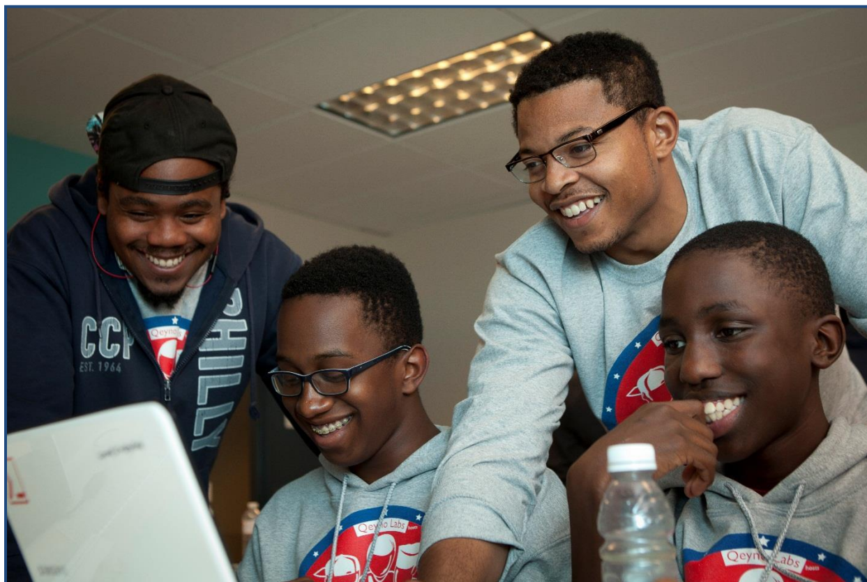
Students at the My Brother's Keeper Hackathon in Philadelphia, Pennsylvania, November 2014.

specialized services will prepare individuals for employment while they are incarcerated to increase their opportunities for successful reentry into their communities upon release. LEAP builds on promising strategies being implemented in a number of correctional facilities across the country, including the MontgomeryWorks Satellite One-Stop Career Center/American Job Center within the Montgomery County, Maryland county jail system.