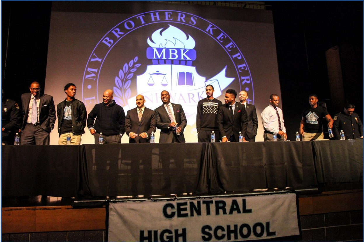
Mayor Ras Baraka and other dignitaries at a My Brother's Keeper forum in Newark, New Jersey, January 6, 2015.